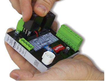
ES52 with on-board 20A relays, fuses and annunciator strip

* Failure inputs can close to either +battery or ground. All failure inputs are ignored for a period of 15 seconds at engine startup.