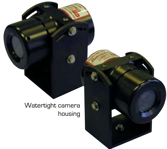
Watertight camera housing